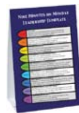
Desktop Reference Card