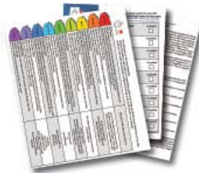
The Nine Minutes Tracker & Templates